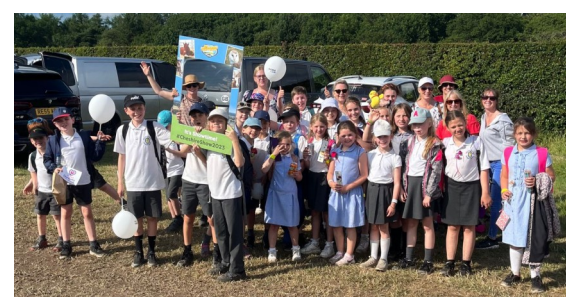
Well done all who took part. The children were a particular credit to the school in the way they carried on like professionals in light of some biblical weather!

Our 29 strong choir and band performed brilliantly at the Cheshire Show on Wednesday.