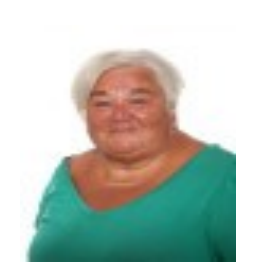
Co-opted governor appointed by the governing body