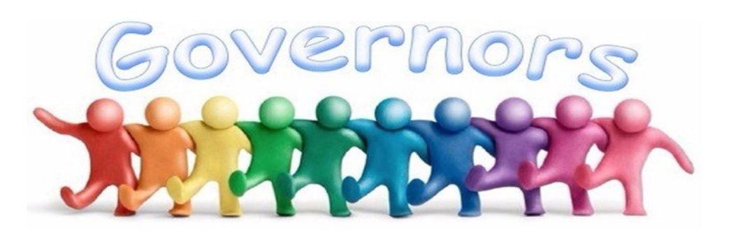
Meet our Governors